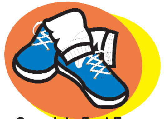
Complete Foot Exam